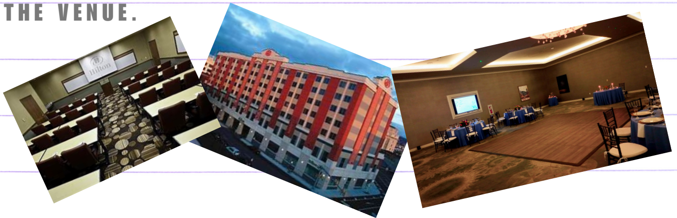
Hilton Scranton and Conference Center