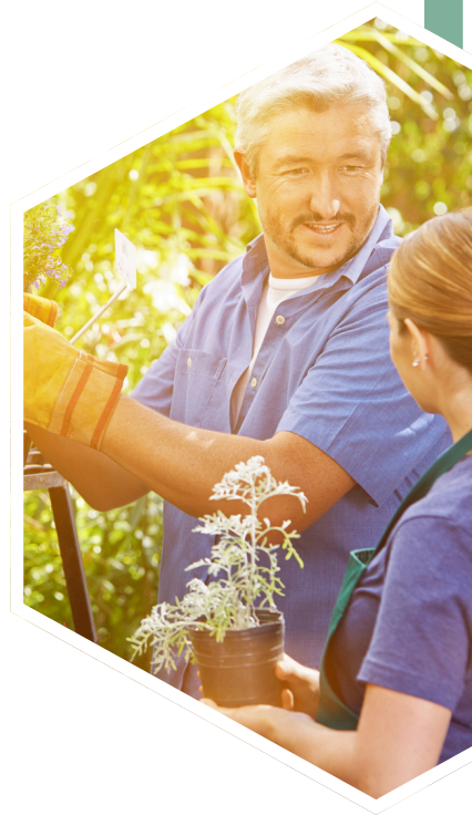
Exhibit Sponsor - $875